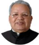
Shri Kalraj Mishra Hon'ble Governor of Rajasthan